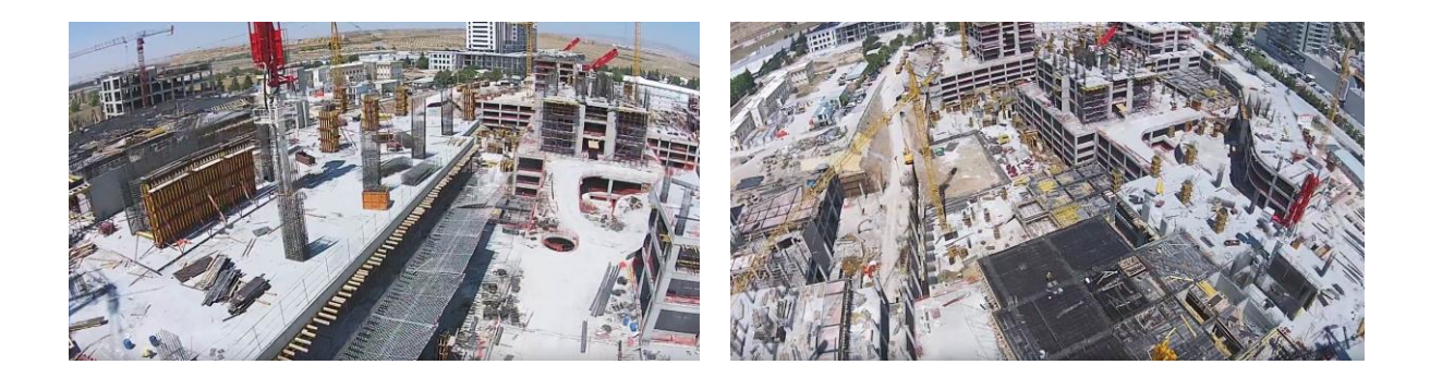
Figure 1: Aerial photographs taken by drone

Significant improvements in the computer vision community enabled to create 3-dimensional point clouds from highresolution images from the site using photogrammetry methods (Westoby et al. 2012). Frequently constructed as-built models give an opportunity to identify progress on the site from various angles (Ham et al. 2016). If the geometry of these 3D models is validated with GPS coordinates, centimeter-level accuracy measurements can be performed on this model such as length measurement, area, and volume (Figure 2). Thus, quality assessment is available in anytime and anywhere. Continuous visual data helps to track the progress of the construction and empowers to take precautions to maintain a continuous flow.