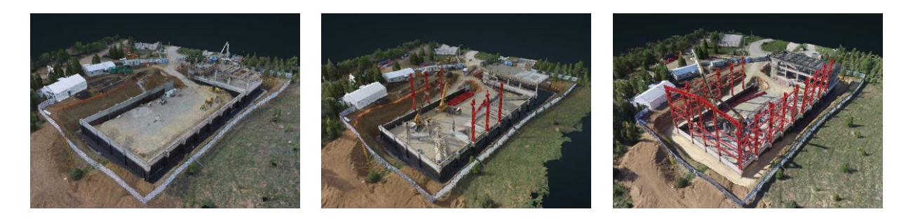
Figure 3: The sequence of 3D Models

Continuous Improvement. In practice, most of the progress information is not digital, and they are stored on the hard copy files temporarily. There is no online environment that progress updates are stored in and shared with stakeholders. The sequence of the as-built models created from site photographs is a progress log of the construction (Figure 3). Thus, retrospective knowledge is always available and searchable.